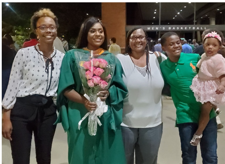
Breaking the cycle of poverty: Recipient family celebrates a college graduation.

How Does It Work? Social service agencies in rural areas identify potential recipients who desire to become self-sufficient by screening applicants and referring them to The Box Project. After receiving applications, The Box Project connects sponsors with recipients allowing a relationship to develop.